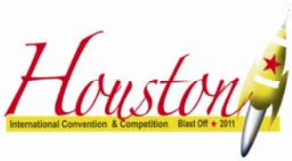
Exhibit Space Information